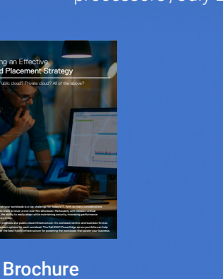
Workload Placement Strategy